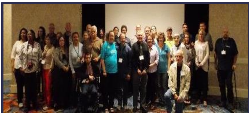
2013 | San Diego