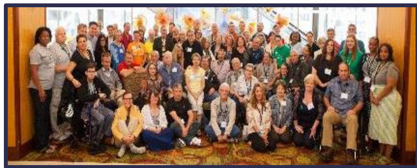
2015 | Houston