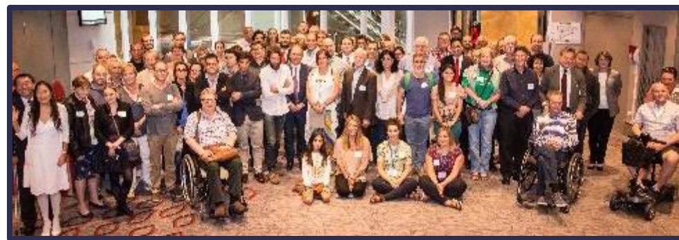
2016 | Paris