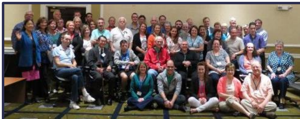
2014 | Bethesda